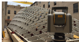
MOYNIHAN STATION New York, NY $1.6B